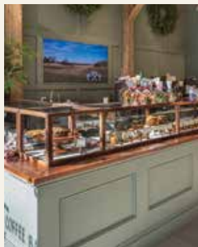
YOUNGS FARM at HIRSHLEIFERS

T here is so much to see and explore! Grab a sweet at Kith Treats , meet a friend for a sip at Ralph's Coffee , or enjoy a lite bite at the newly renovated Youngs Farm Cafe located just inside our very own Hirshleifers boutique. This location boasts a cozy farm inspired cafe providing the perfect place for people to come together and take a break from their busy day. Besides coffee, tea, espresso, signature drinks, and freshly made desserts — customers can also shop a curated collection of merchandise at some of these tasty locations.