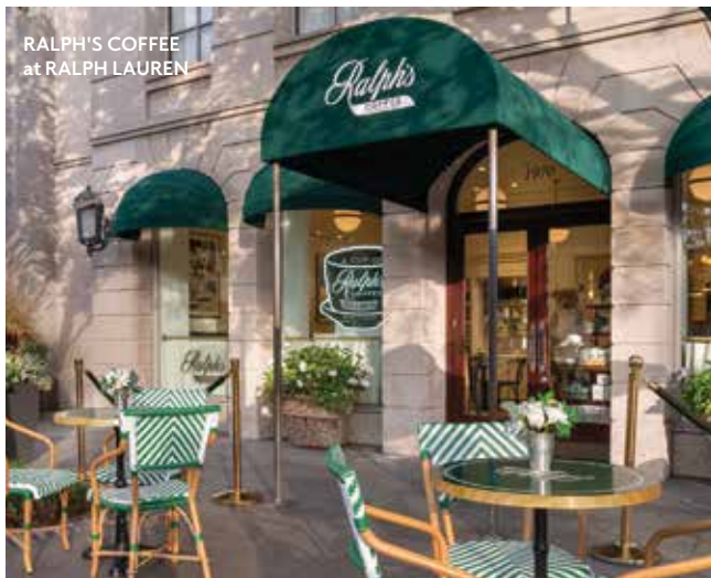
RALPH'S COFFEE at RALPH LAUREN

2060 Northern Boulevard • Manhasset, NY 800.818.6767 • americanamanhasset.com