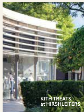
KITH TREATS at HIRSHLEIFERS